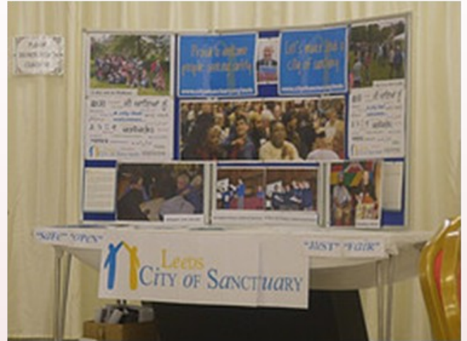
Display for Leeds City of Sanctuary

Leeds City of Sanctuary is encouraging businesses, churches, schools, mosques, individuals, community groups, and many others to sign a sanctuary pledge. If your church would like to sign up as a Church of Sanctuary please visit www.cityofsanctuary.com/leeds to sign the pledge.