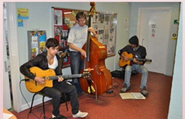
Great music and food during a Refugee Week event in Leeds