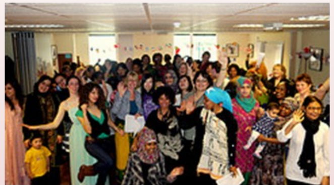
City of Sanctuary celebrations on Women's Culture Day in Leeds

We pray for those who minister to the vulnerable and broken people especially the homeless and displaced: that they may show God's welcoming love.