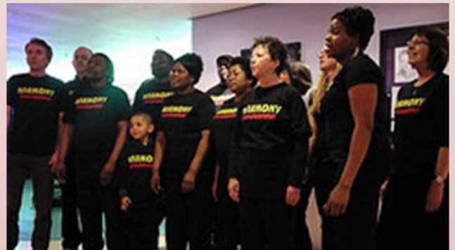
Singers performing during events held at West Yorkshire Playhouse in Leeds, around the theme of 'Refugee Boy' by Benjamin Zephaniah

We pray for all who have had to escape violence and persecution in their own countries and seek refuge in places that are foreign to them.