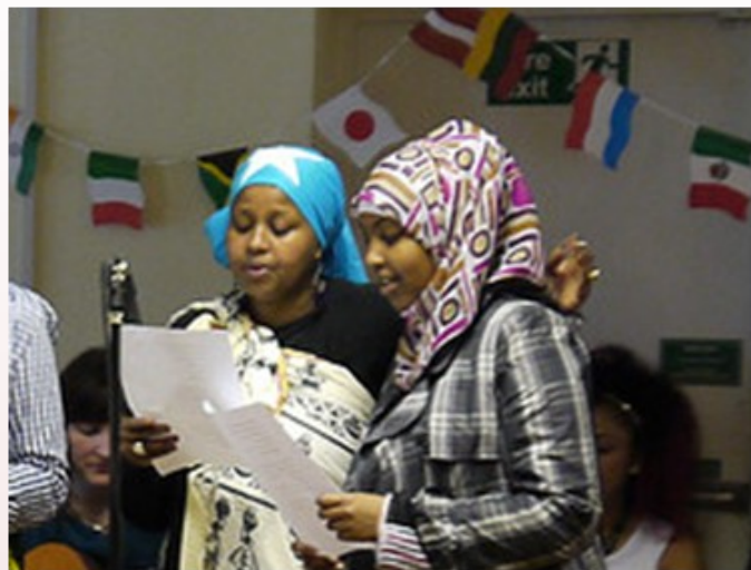
Women performing at Women's Culture Day in Leeds

0113 350 8608, www.manuelbravo.org.uk , office@manuelbravo.org.uk