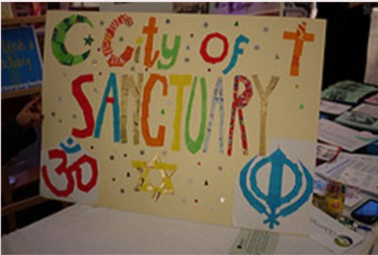
City of Sanctuary poster displayed during Leeds interfaith week 2013

Sanctuary Sunday is an opportunity for church congregations to focus their Sunday service on the issue of sanctuary , and to reflect on how we can all contribute to creating a culture of welcome and hospitality for asylum seekers and refugees in our communities.