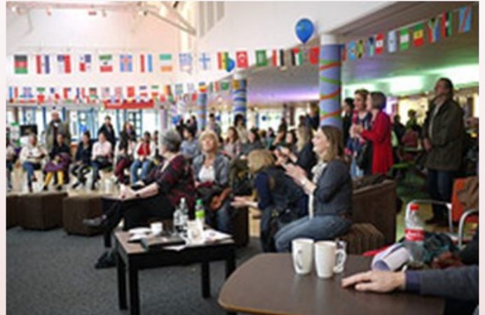
Guests enjoying an event at West Yorkshire Playhouse, which is making strides to become the first ever Theatre of Sanctuary

Leeds City of Sanctuary c/o RETAS The Roundhay Road Resource Centre 233-237 Roundhay Road Leeds LS8 4HS