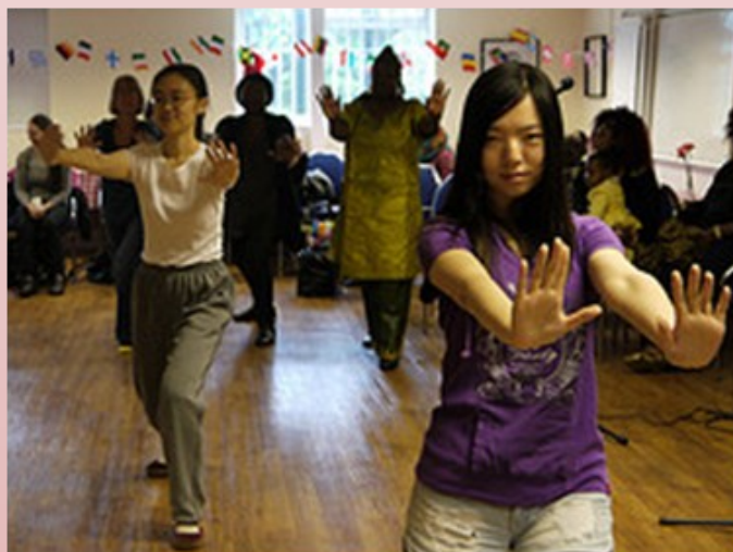
Dancers performing at Women's Culture Day in Leeds

info@retasleeds.org.uk , 0113 3805630, www.retasleeds.org.uk